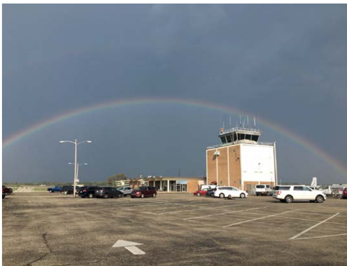
Rainbow over JXN