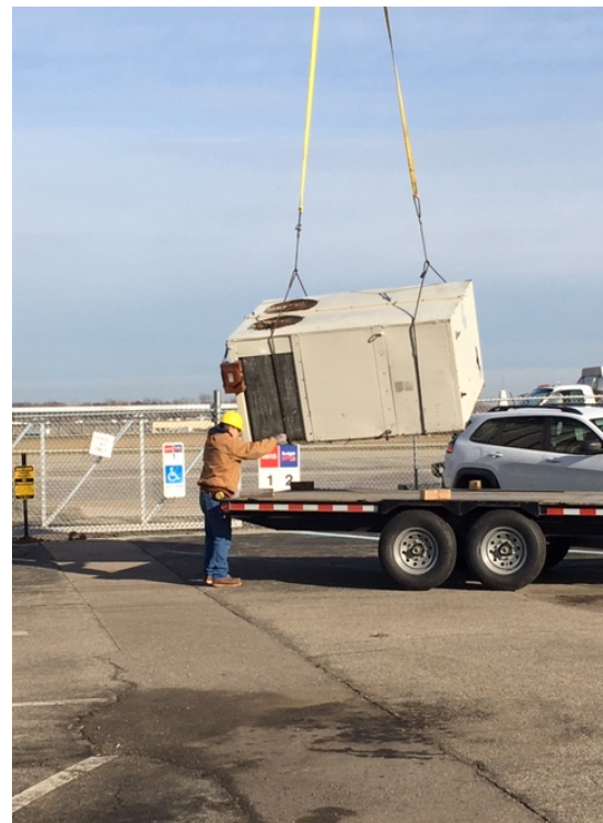
We say Good Bye to the 1980's Vintage HVAC system.