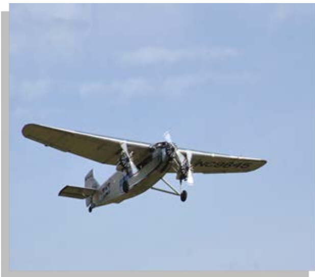
1928 Ford Tri- Motor

The display is an attempt to show how important it is to remember those who have made sacrifices and is especially true of our veterans who didn't come home.