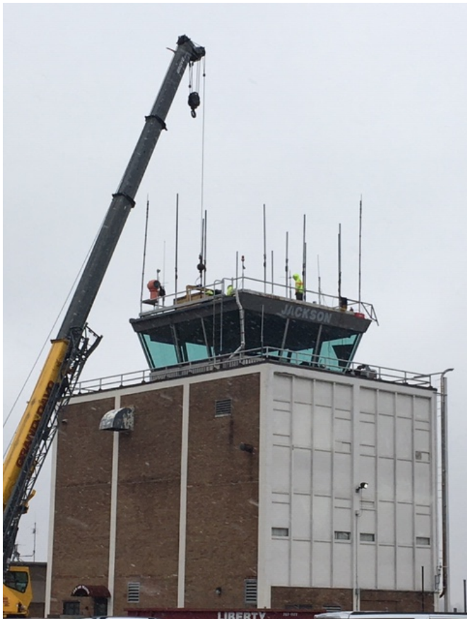
Roofing materials being dropped off

Extreme weather conditions in 2018 exposed some issues with our Control tower roof. These issues required emergency repairs, and funds were approved in 2019 to replace the roof and HVAC system. McDonald Roofing and Ajax Heating & Air Conditioning braved the winds and cold of November and completed the job just before the end of the year. Now we have a much more energy efficient HVAC System and a roof that will last for many years.