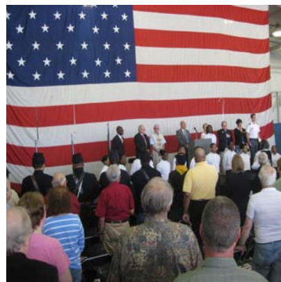
US Sen. Carl Levin and other Armed Forces Day event speakers.

Click on the following link to see a video of the statue's unveiling. http://www.co.jackson.mi.us/Agencies/airport/media.asp