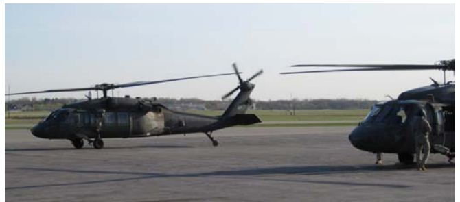
Military helicopters frequently stop at JXN for food and fuel