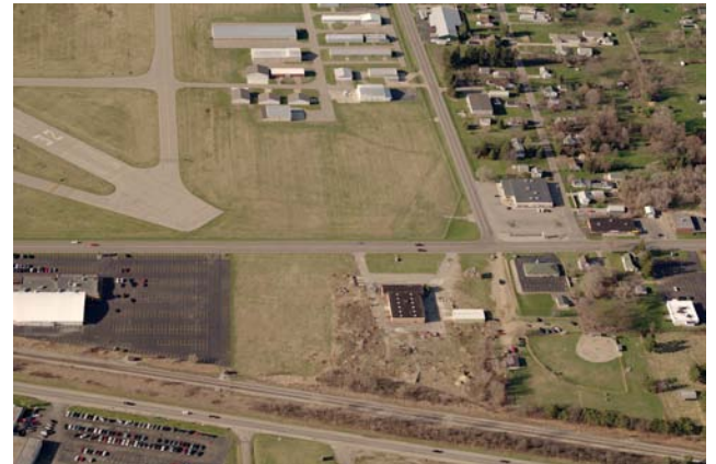
New SRE site is pictured above. The road on the south side is Wildwood Avenue and the road on the east side is Airport Road.