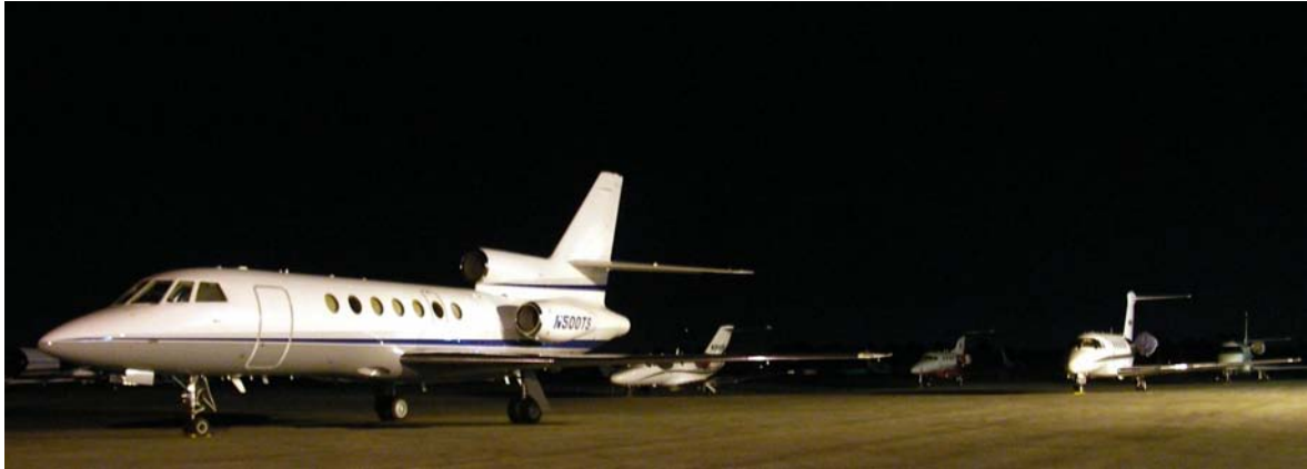
A night photo of some of the many aircraft parked at the airport during Michigan International Speedway NASCAR race weekend taken by an airport "airport watch" volunteer.