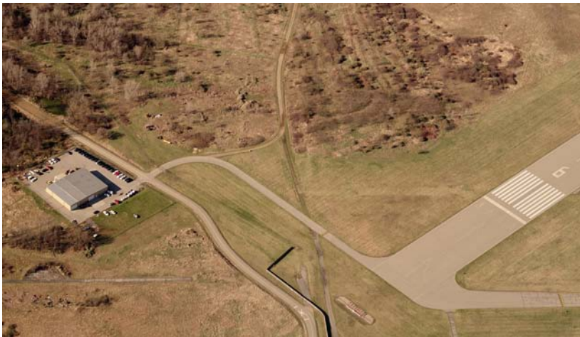
Current Snow Removal Equipment Building located on Woodville Road near the Runway #6 approach

The design is scheduled to be completed by early fall with construction being planned for 2012.