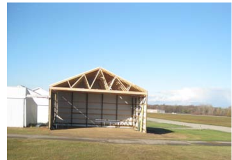
A new hangar located on the east side of the airport owned and constructed by Ed Gorzen