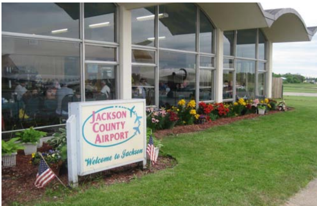
Through the green thumb efforts of Airport Restaurant owner Dianne Weems and volunteer Fay Bolender, the front of the terminal is looking good.