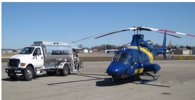
University of Michigan helicopter being refueled by Skyway Aviation